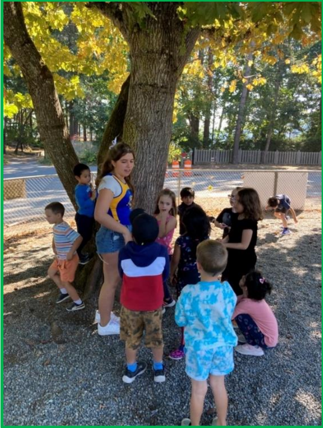
Grateful to our Amazing Leadership Team!