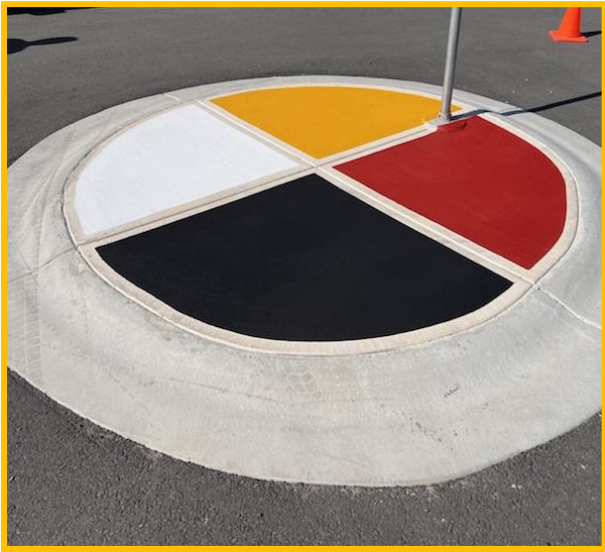
Our new Medicine Wheel addition.