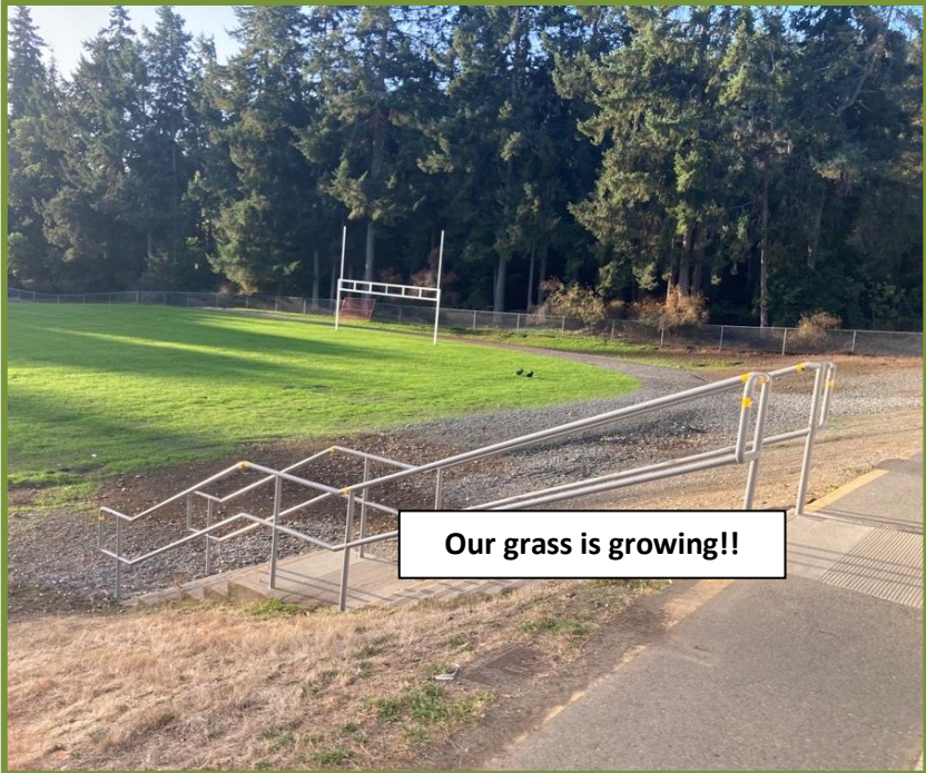
Our grass is growing!!