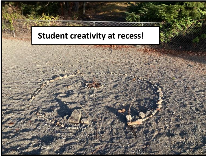
Student creativity at recess!