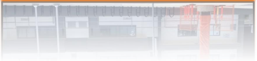
1pm Unveiling of Welcome Pole Sept 30th