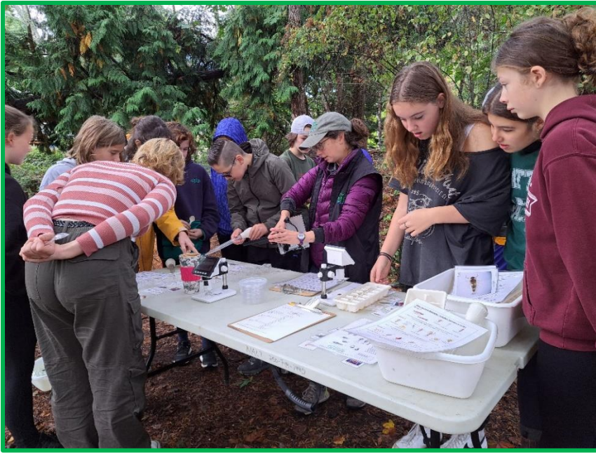
Working with NALT identifying Macroinvertebrates in Walley Creek.