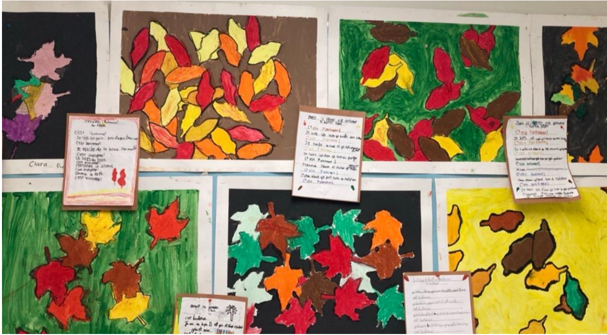
Beautiful artwork by grade 2/3s students (above) and Kindergarten students (below).