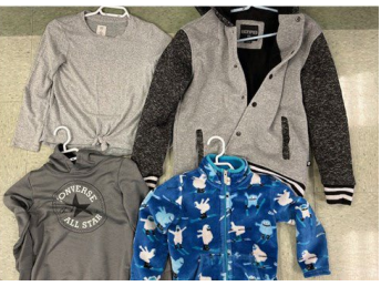
Do you recognize these items?