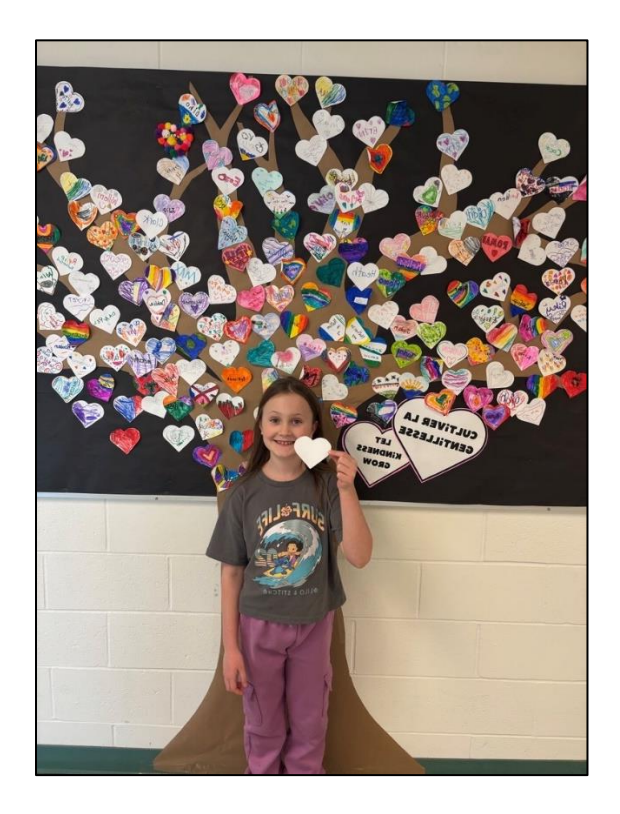
STUDENTS CAUGHT BEING KIND. BRAVO ! Kindness and gratitude continues to grow at Ecole Hammond Bay!