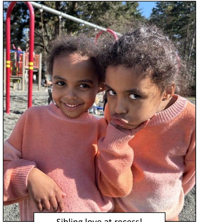
Sibling love at recess!