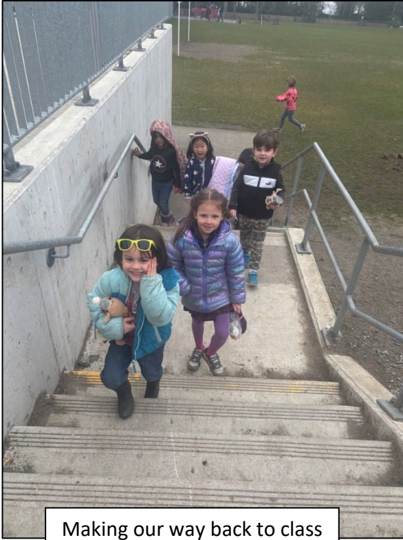
Making our way back to class lineups after recess