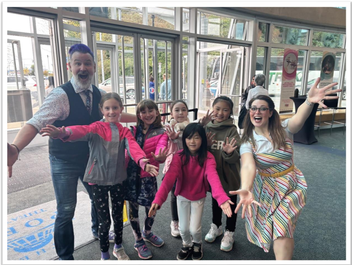
The Alphabet of Science at the Port Theatre!