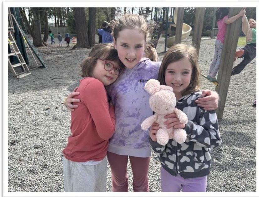
Stuffies, Twin toy lizards and a 3-D printed dragon join their owners for some recess fun at Ecole Hammond Bay.