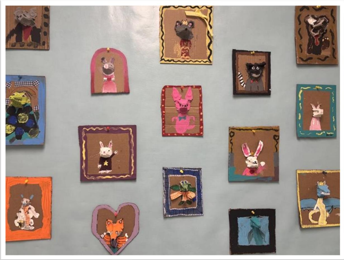
Art work by students