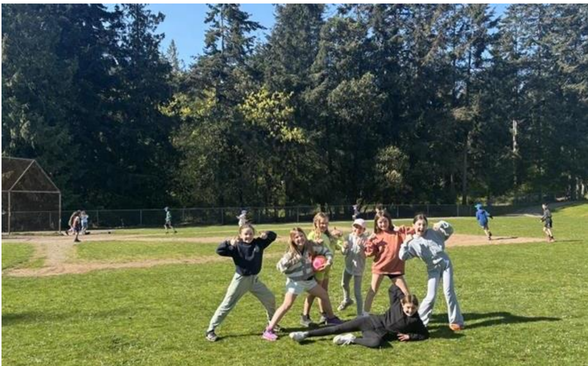
Casual Recess “Baseball” Game and Fun Loving Photo Bombing by Friends