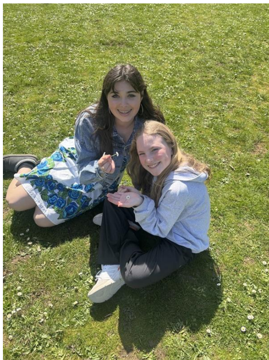
Daisy Chains and Fairy Weights