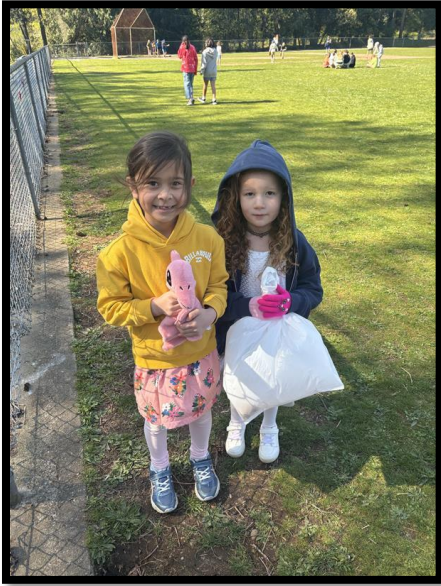
Volunteer Clean up by a couple of our grade 1 students