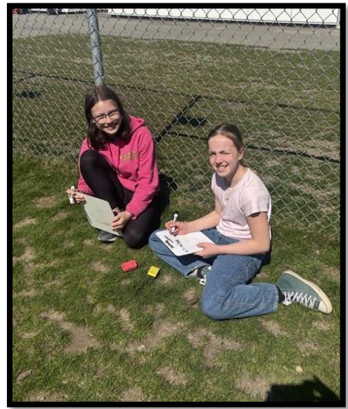
Planning of Earth Day by two grade 6 students